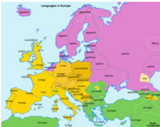
Figure 3: The word for the fruit orange in various European languages.

So, quite paradoxically, Portuguese has a peculiar word for orange, and the name for orange in a number of languages evokes the name of Portugal. On Reddit, we can find at least two discussions about orange names. The first one 16 , entitled "The word for the fruit orange in various European languages" presents a colorful map (cf. Figure 3) with the distribution of orange names according to their linguistic origin. It certainly contains inaccurate details (the discussion reveals several discrepancies with speakers from many of these languages), but it helps to visualize the geographic distribution of these etymological word families. In Central and Western Europe, the Sanskrit/Arabic word dominates, either in its simple form (cf. Castilian naranja , Italian arancia , Portuguese laranja , French orange ) or in a compound preceded by a descendant of the Latin word pomus (cf. Polish pomarańczowy ). Then Germany, Northern Europe, Eastern Europe and Asia typically adopt a compound formed by Apfel (the German translation of pomus ) and a modifier that related to China (cf. German Apfelsine ). Finally, North Africa, Greece and some neighboring languages choose words related to Portugal (cf. 5). The second map 17 draws a hypothesis for the spreading of the words for orange (cf. Figure 4).