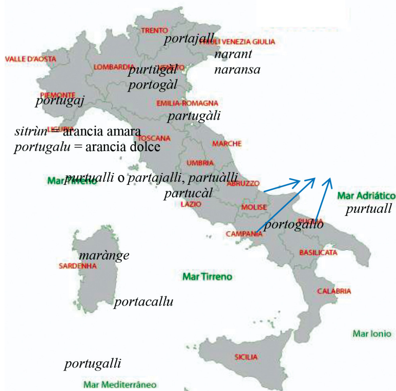
Figure 5: Orange in some Italian dialects.

it spread to Romanian and to Arabic. Apart from the fact that Portugal is not the name for orange in Portuguese, as this map suggests, it is also questionable to set a dissemination route based on no evidence. Is it plausible that a Venetian name for orange (i.e. portogallo ) moved into Greek and from Greek to Arabic, Macedonian, Romanian, Turkish, Georgian and maybe some more languages or dialects in close-by regions? Though no references are provided, Wikipedia's Italian entry on citrus sinensis 18 gathers some dialectal information that is displayed in the following diagram: